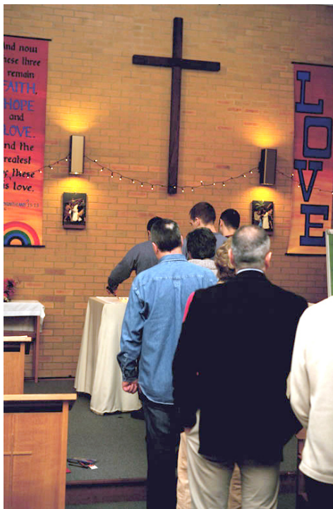
Learners during a final session of a Sycamore Tree course

We would like to say thank you to all who have responded to our Transforming Lives appeal. This much needed money will help us to continue to embrace the vision of Prison Fellowship to engage in 'seeing lives transformed,' and we are excited about how God is going to use us all to strengthen and grow our ministry.