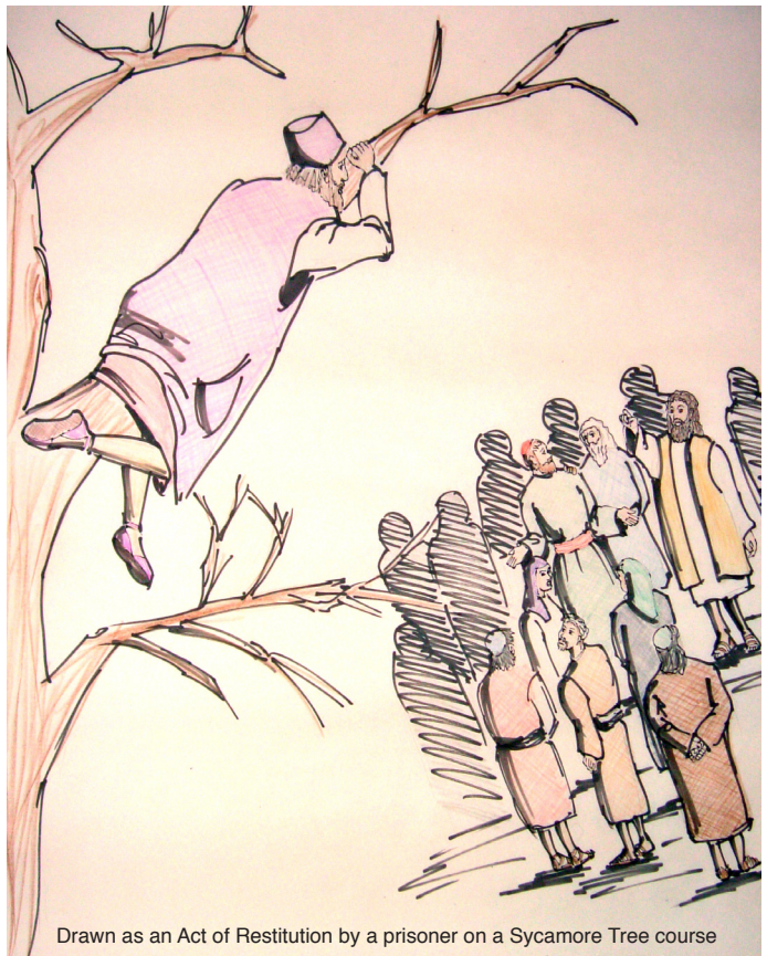
Drawn as an Act of Restitution by a prisoner on a Sycamore Tree course