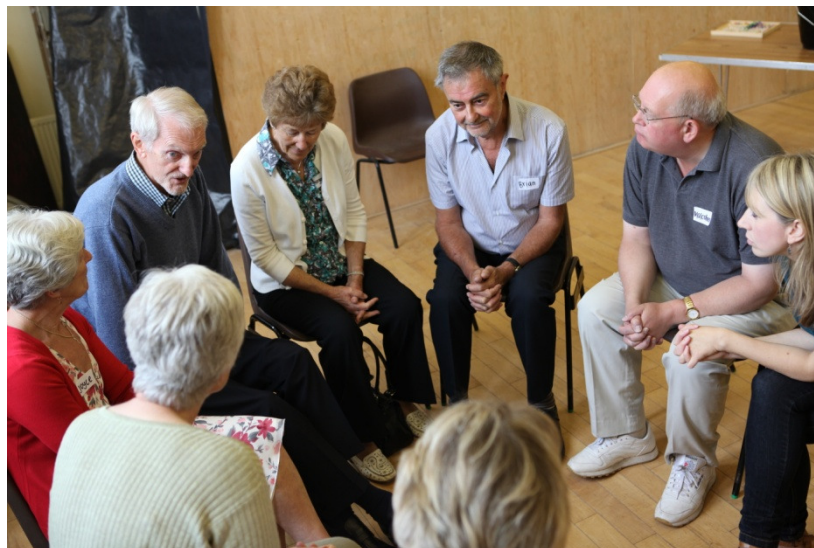
Join a Prayer Group